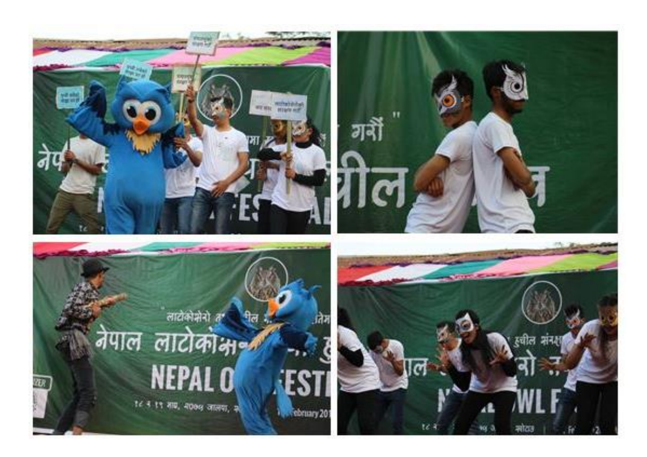
PHOTO: Flash mob performed by IOF students was applauded by huge audience during second day of the festival. Their flash mob ended with short and sweet act and speech on conservation of all the wildlife particularly owls.