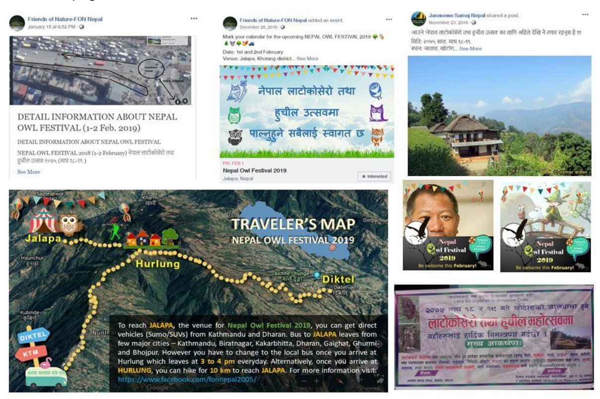
Promotional post of Nepal Owl Festival by Friends of Nature, local organization and individuals

We started the preparation for the festival two months prior to the festival date. After the venue was fixed, we started posting promotional videos and photos about the venue, program description and promotional material of the festival on our official website and Facebook page.