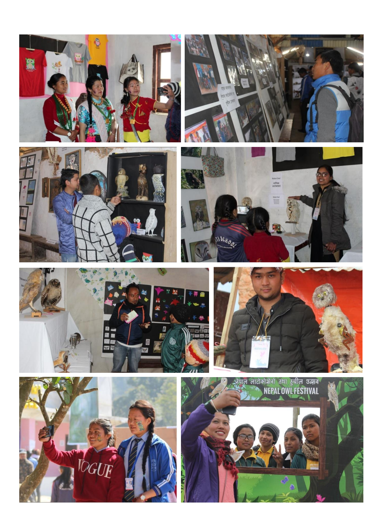
PHOTOS: Owl robots, video call device, owl specimen, fancy owl curios, photo booth and owl research equipment were often crowded by the visitors during the second day of the festival. Visitors were making notes of interesting information from the museum as volunteers briefed about the item displayed.