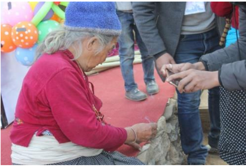
Lathro Katne (लाश्रो काट्ने)

In this traditional game, the traditional cap is placed on a top of stick which is fixed vertically in the ground. Players use the traditional Nepali blade, Khukuri and start cutting the stick in quick slashes after the whistle is blown. When done right, the cut piece of the stick falls vertically and the cap lands on top of the remaining part of stick. This is repeated as