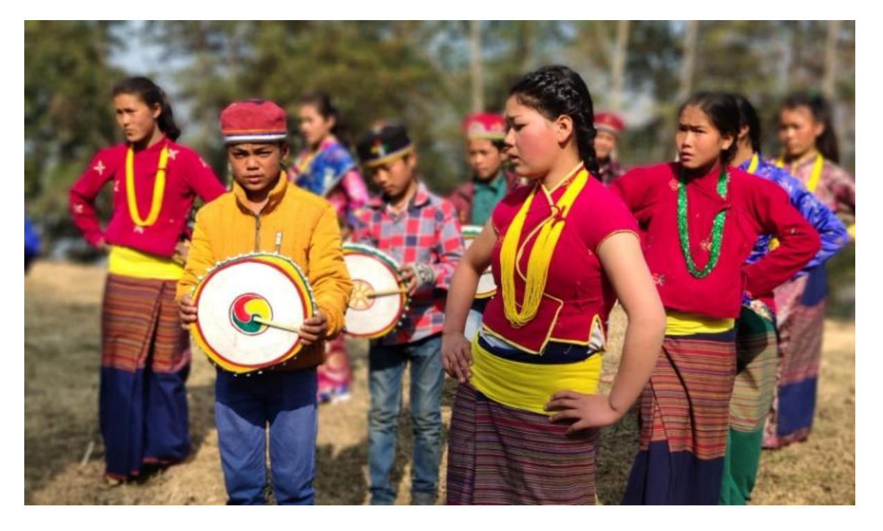
PHOTO: Tamang Selo was performed by the students from Jalapa at Nepal Owl Festival 2019.