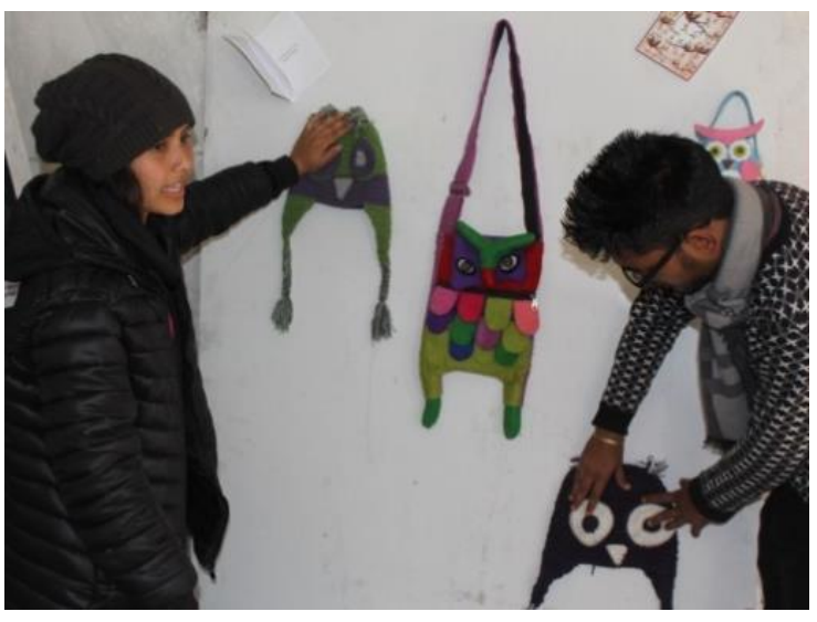
PHOTOS: Volunteers work tirelessly and make the owl museum as a center of attraction at the festival. After four days of complete hard work, volunteers make the museum ready for the visitors.