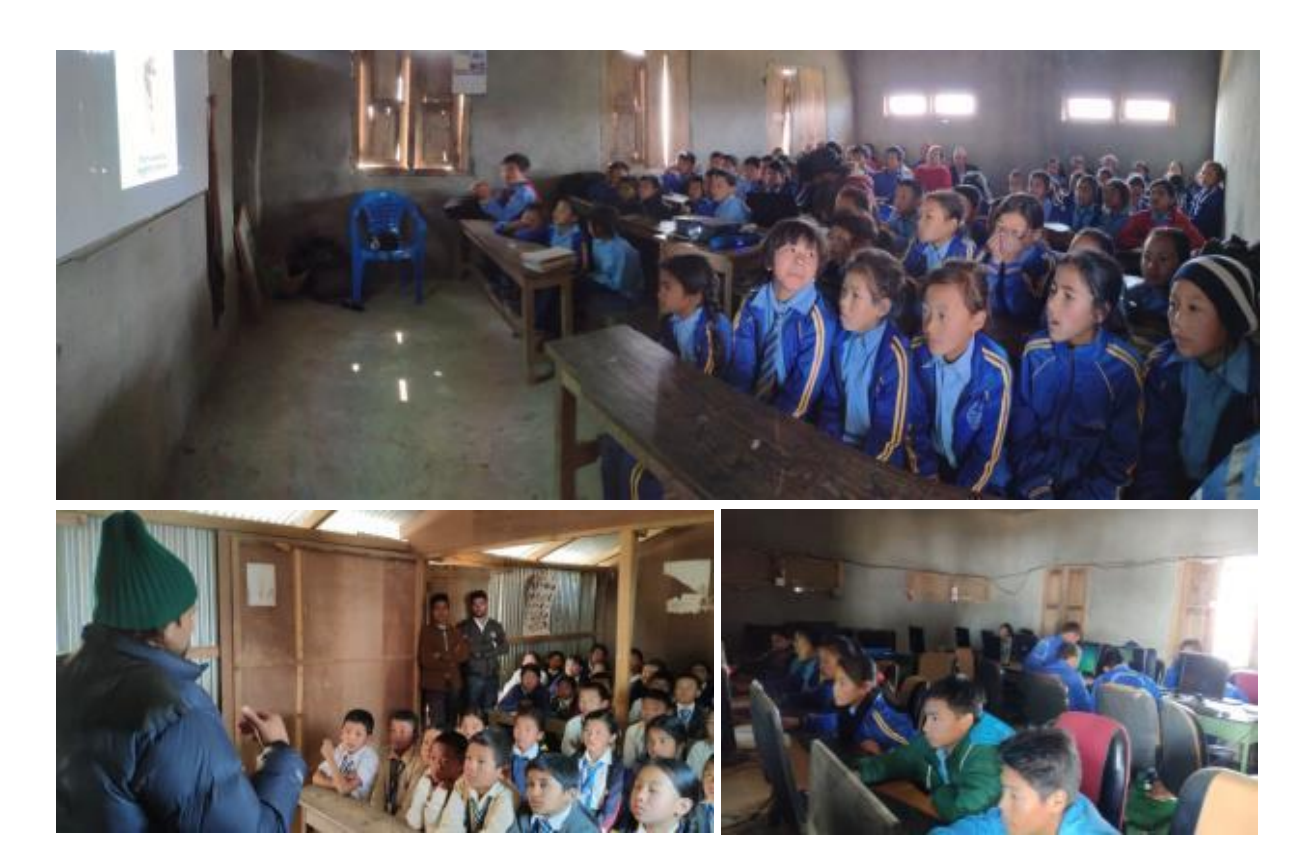
PHOTO: Owl conservation camps in various schools of Khotang district.