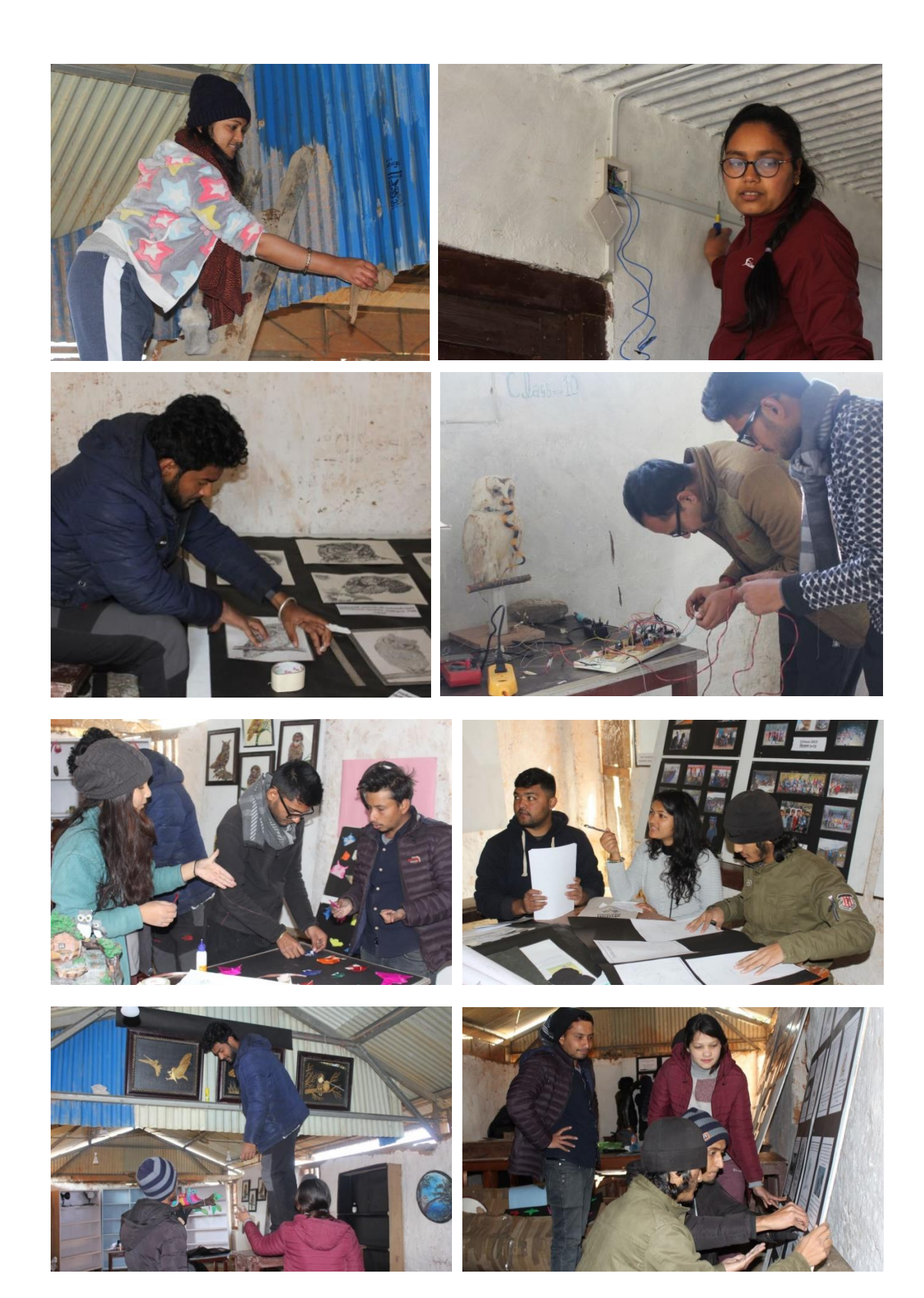
PHOTOS: Unpacking boxes, repairing damaged curios, checking electrics and electronics, cutting, and pasting goes on for next two three days.