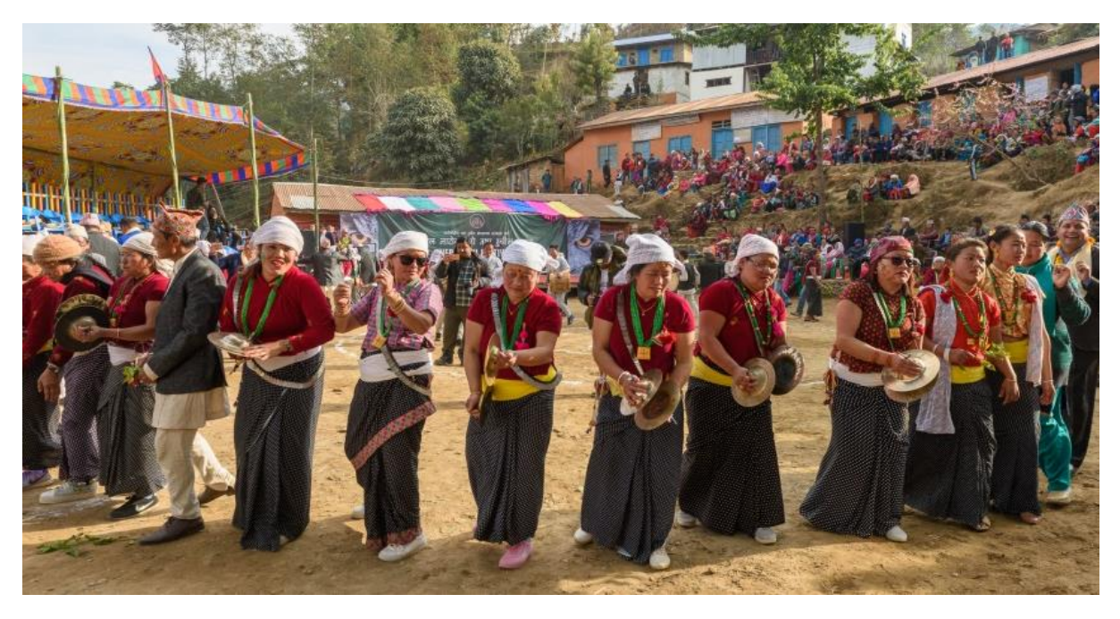
PHOTO: Locals from Rai community performing Sakela silli on first day of Nepal Owl Festival, 2019 at Jalapa.

Although Jalapa has dominant settlement of Rai community, scattered settlements of Newar, Tamang, Sherpa and Gurung have well preserved their culture making the settlement more heterogeneous. During the festival, students and locals performed several cultural dances and songs representing aforementioned cultures.