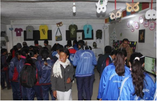
PHOTOS: Students and local youths spend more time in the museum. They go through displayed items and carefully listen to the description of those items provided by our volunteers. Around 2500 visitors passed through the hit counter while entering museum in the first day.