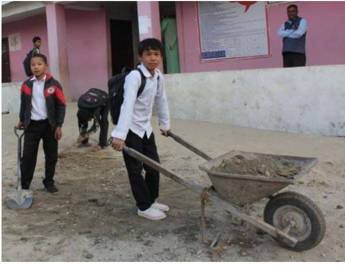
PHOTOS: Making of temporary owl museum begins with arranging furniture and cleaning them. Volunteers including local students make the museum hall as well as it premises clean & attractive.